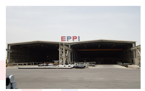
Large Production Facilities

EPPI was established in the year 2000 in response to the needs of the local market in having a reliable manufacturer for preinsulated pipes for the district cooling industry. Our manufacturing facility is located in the Industrial City of Abu Dhabi (ICAD-1) with two major factories occupying a combined plant area of 48000 square meters. Our storage areas are capable of stockpiling more than 50-km of pipes in mixed sizes, several thousands of fittings, hundreds of tons of raw material in both plastics and chemicals.