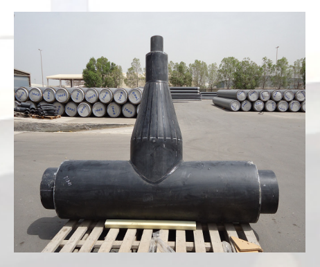
Preinsulated HDPE fitting