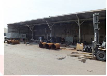
Steel Fabrication Workshop

EPPI has a team of highly trained fabricators, technicians and certified welders to handle all steel pipe fabrication processes including cutting, threading, grooving and welding according to international standards such as API and ASME. All welding processes will undergo non destructive testing along with the required in-house and third-party test programs.