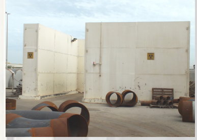
Non Destructive Test Bunker