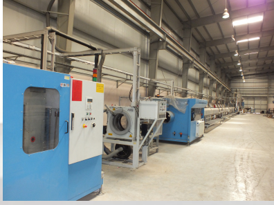
HDPE Extrusion Line - 400