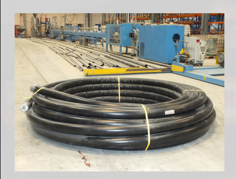
Preinsulated Flexible Pipe (100 M)