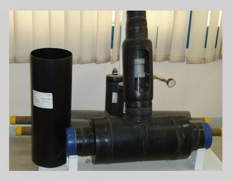
Ray Joint Coupling