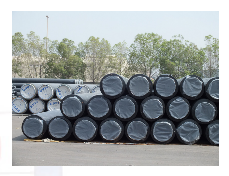
Preinsulated Pipes Storage